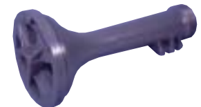
VENTITE™ Inspirator Mixers (see catalog bulletin 3300)