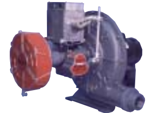
PREMIX® Blower Mixers (see catalog bulletin 3100)

Air/gas premixing equipment used to provide thorough blending of air/gas mixture to Maxon Burner Nozzles