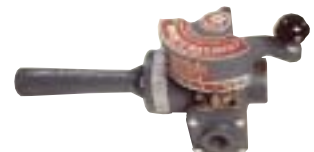
MULTI-RATIO® Mixers (see catalog bulletin 3200)